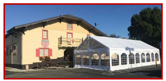
Swiss Park Hall with Outdoor dining tent

7. Tickets, unknown date, Refreshments 10 cents; Refreshments 30cents - Patrons paid for drinks with tickets at the dances. There was also a "uniformed guard" at the dances.